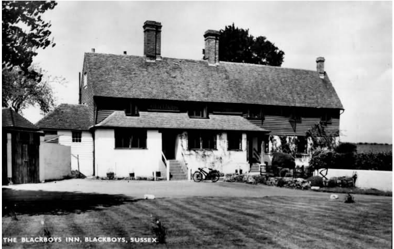
Blackboys Inn 1935