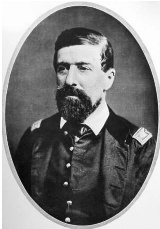
MAJOR GRANVILLE HALLER

In early September, 1854, MAJOR GRANVILLE HALLER set out with a US Military Force from their post in Oregon to avenge the WARD PARTY deaths. Upon arrival at the rebuilt Hudson Bay's FORT BOISE near the mouth of the Boise River, the Indians they encountered were arrested, but released after proving their innocence. The next day, four Indians were arrested - three were killed and one was wounded, but escaped.